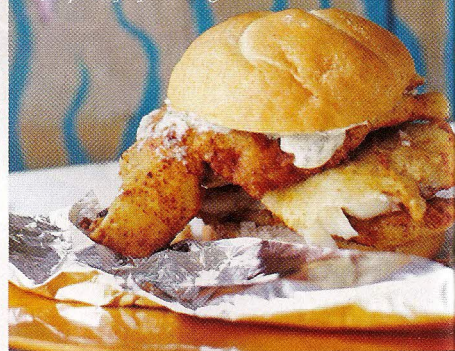
BEST FRIED FISH BET'S FISH FRY, Boothbay (see p. 160 for full listing)

Budget-conscious travelers love this spotless, family-owned, 1950s-era motel—and its walk-to-everything downtown location averts any parking hassles. Rates: from $89. 96 McKown St. 207-633-2751; midtownmaine.com